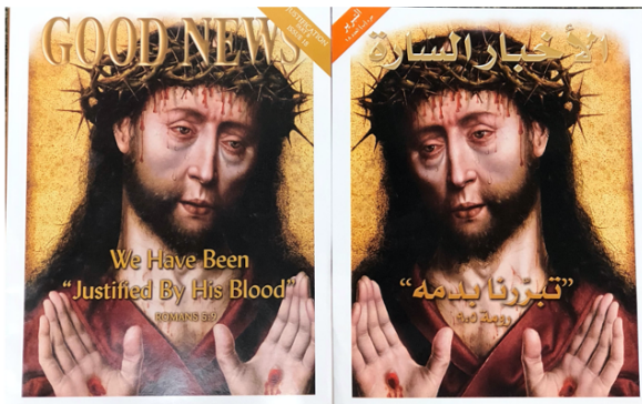
Good News Magazine English and Arabic Edition