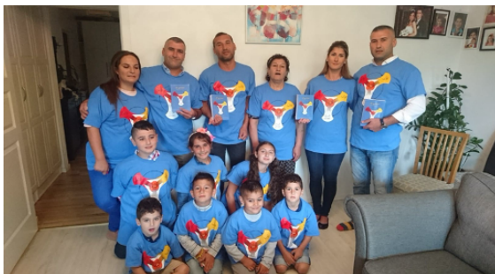
Bible study in Stockholm, Sweden.